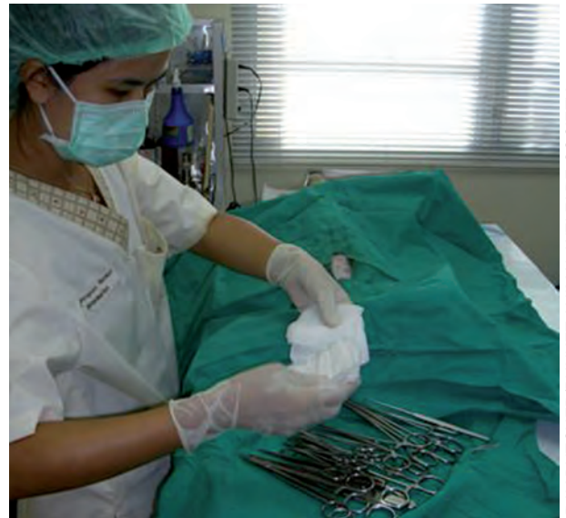
Surgery using aseptic techniques, Thailand.