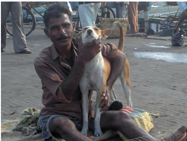
Fisherman and community dog in India.