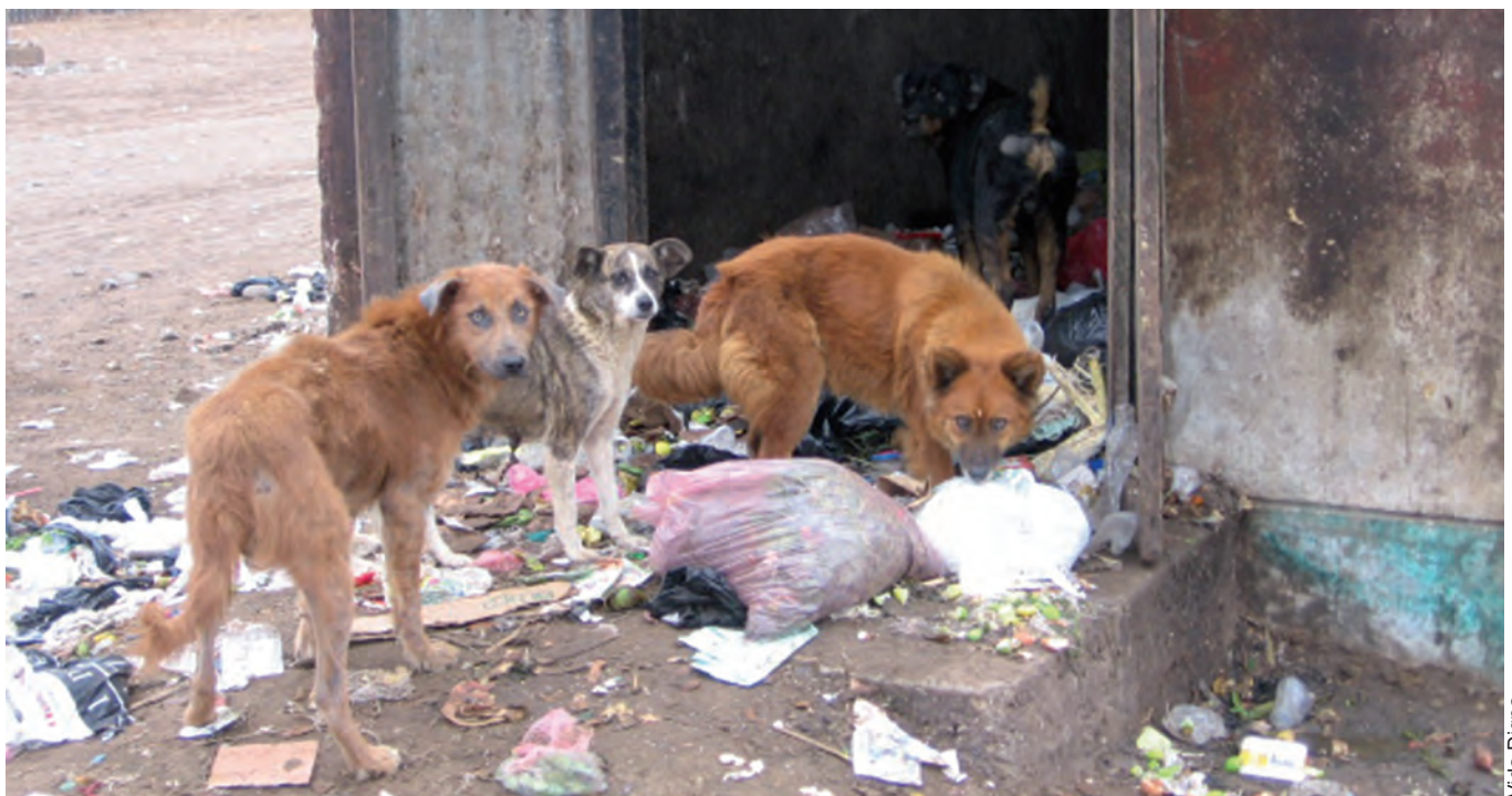
Roaming dogs feeding from rubbish in Peru.