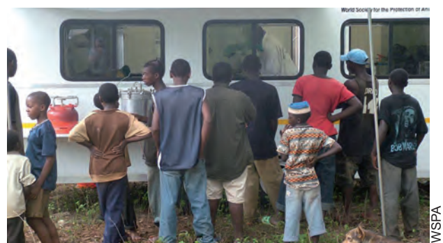
Local people watching surgical sterilisation through windows of mobile clinic on Zanzibar.

In 2006, there was a similar situation in Zanzibar when WSPA and the local government introduced a sterilisation intervention. It started with low compliance, with few owners willing to bring their animals for sterilisation. However, over a period of months, the education programme, discussions with key community leaders and actual examples of healthy sterilised animals began to create a change in human attitudes, leading people to actively bring their animals to be sterilised.