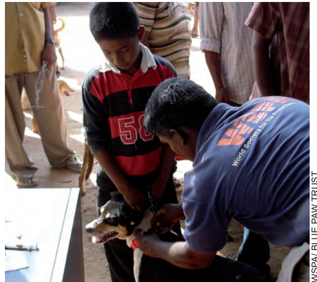
WSPA/BLUE PAW TRUST